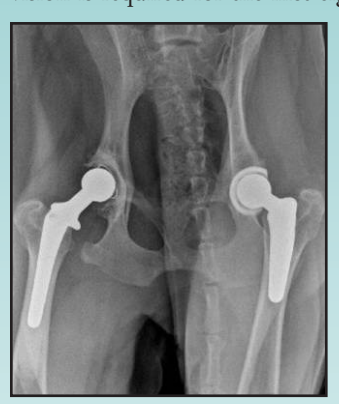
Post-operative radiograph of a cementless THR & cemented THR

Proper home care after surgery is very important to the success of the procedure. Strict confinement and close supervision is required for the first eight weeks after surgery and