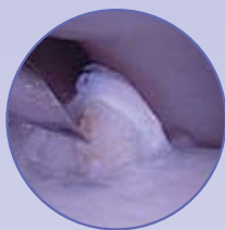
Arthroscopic view of a canine elbow joint – identification and removal of an fragmented coronoid process

Diagnosis is confirmed by radiographs or computed tomography (CT). Radiographs can diagnose a UAP, most OCD lesions and often EI although it does not diagnose a FCP. Radiographs are also useful to rule out other conditions such as fractures or dislocations. A CT scan is necessary to visualize the FCP lesion although plain radiographs will reveal the secondary arthritis. A CT scan allows three dimensional reconstruction of the joint for more thorough evaluation of specific regions of the elbow.