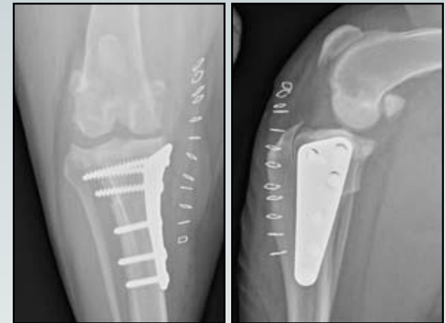
Postoperative radiographs following a TPLO.

The tibial plateau leveling osteotomy (TPLO) eliminates the need for the cruciate ligament by leveling the surface of the tibia (the bone below the knee joint) without disturbing the cartilage. A semicircular, full-thickness cut in the tibia is performed and the piece is rotated so that the surface is close to perpendicular to the tibia. The bone is then stabilized with a bone plate and screws. The outcome following the TPLO is characterized by early return to weight-bearing function and durable, lifelong repair. The prognosis is good to excellent, giving the best chance for resumption of normal activities for medium-to-large breed dogs (over 40 lbs.) with an active or working lifestyle, or those with other concurrent orthopedic problems.