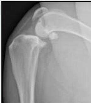
Lateral stifle radiograph demonstrating changes that are commonly found in patients with a cruciate ligament tear.

Radiographs are generally advised to rule out other causes of lameness although the cruciate ligaments are not visible. Radiographs are useful to evaluate the stifle joint for swelling and arthritis secondary to the cruciate rupture, and to evaluate the tibial slope (for the TPLO procedure.) An MRI can also be used to visualize the cruciate ligaments, however it does require general anesthesia.