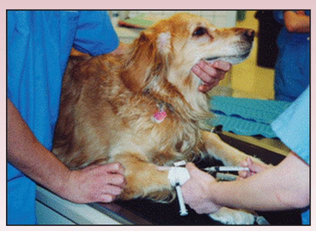
A veterinary technician administers medications through an intravenous catheter to induce general anesthesia in a dog.

Anesthetics are selected for patients based on their health status as determined by physical examination, laboratory results and other diagnostic aids, and the type and length of the procedure to be performed. For example, some injectable anesthetics require breakdown by the liver for the patient to recover from the sedative effects. If the liver is not functioning properly, anesthetic agents requiring deactivation by the liver would not be used, and other agents would be selected for anesthesia.