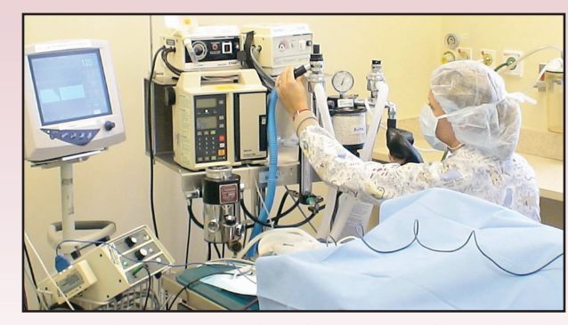
The anesthetic gas, mixed with oxygen, is delivered to the patient through an anesthetic machine. The patient is carefully monitored throughout the anesthetic period.

Our trained technicians will diligently monitor your pet throughout the anesthetic episode with the help of skilled veterinary assistants. Oakland Veterinary Referral Services also employs a veterinary technician specialist (VTS) with advanced training in the field of veterinary anesthesia.