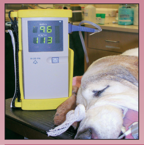
A pulse oximeter monitors oxygen saturation on this anesthetized patient.